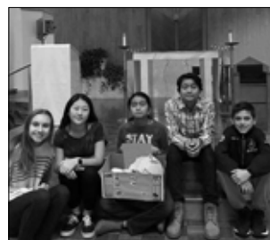
Faith Formation Teen Group