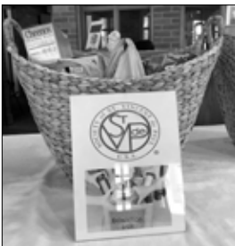
St. Vincent Food Collection

Contact the parish office if you know of anyone who is interested in becoming Catholic or is an already baptized Catholic but needs the other sacraments of Initiation (Reconciliation or Confirmation).