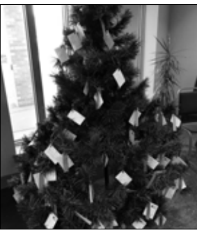
Christmas Giving Tree