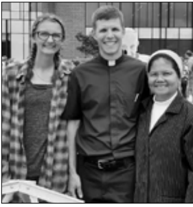
Campus Ministry at NMU Fall Fest