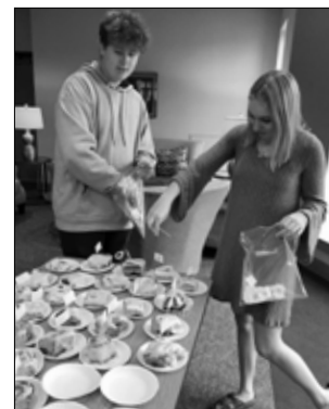
UPCSA Cinnamon Roll Sunday