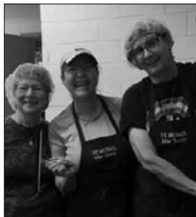
Altar Society Bazaar