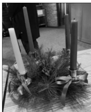
Advent Wreath Blessing