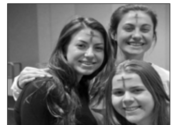
Catholic Campus Ministry- Ash Wednesday