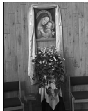
May, Mary's Month