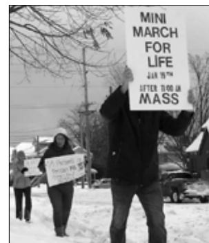
Mini March for Life