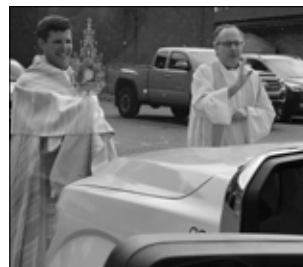
Outdoor Adoration Procession