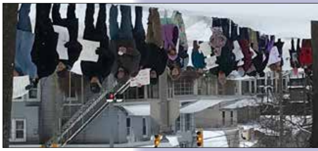
Respect Life Ministry Mini March for Life