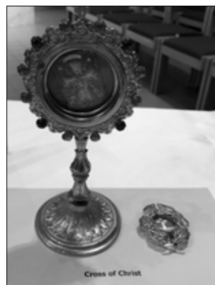
Saint Relics Display: Cross of Christ